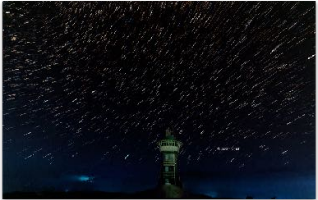
Partial star trails (total exposure time 10 min) at Brasstown Bald. North Star off-set on purpose. Tower light painted